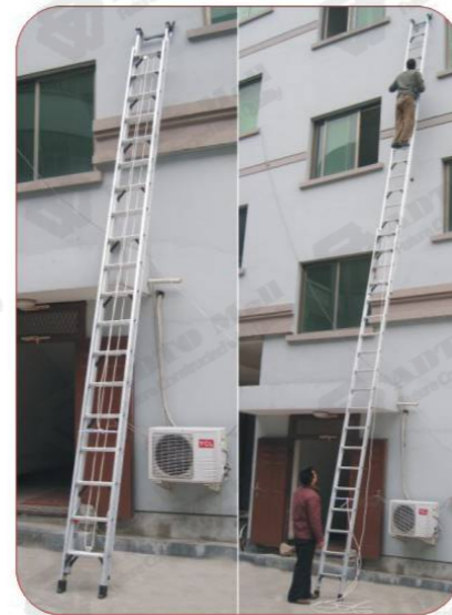
Rope Operated Extension Ladder with "D" shape steps